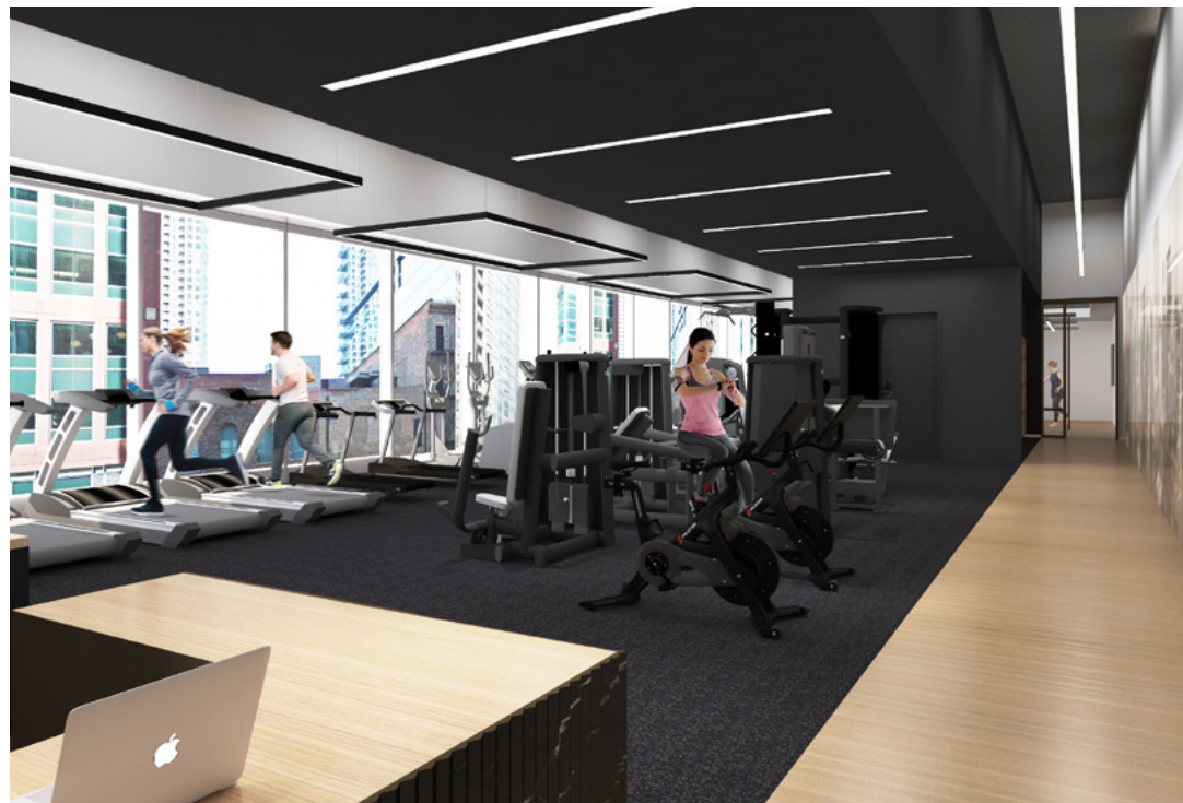
COMING TO 300 NORTH LASALLE: ELEVATED FITNESS CENTER WITH GROUP CLASS STUDIO ROOM. ARTIST RENDERING SUBJECT TO CHANGE.

Our indoor-outdoor riverfront terrace, 24-hour KINETIC® fitness center, and meeting & event space are just a few of the elevated experiences that entice employees to work from the office.