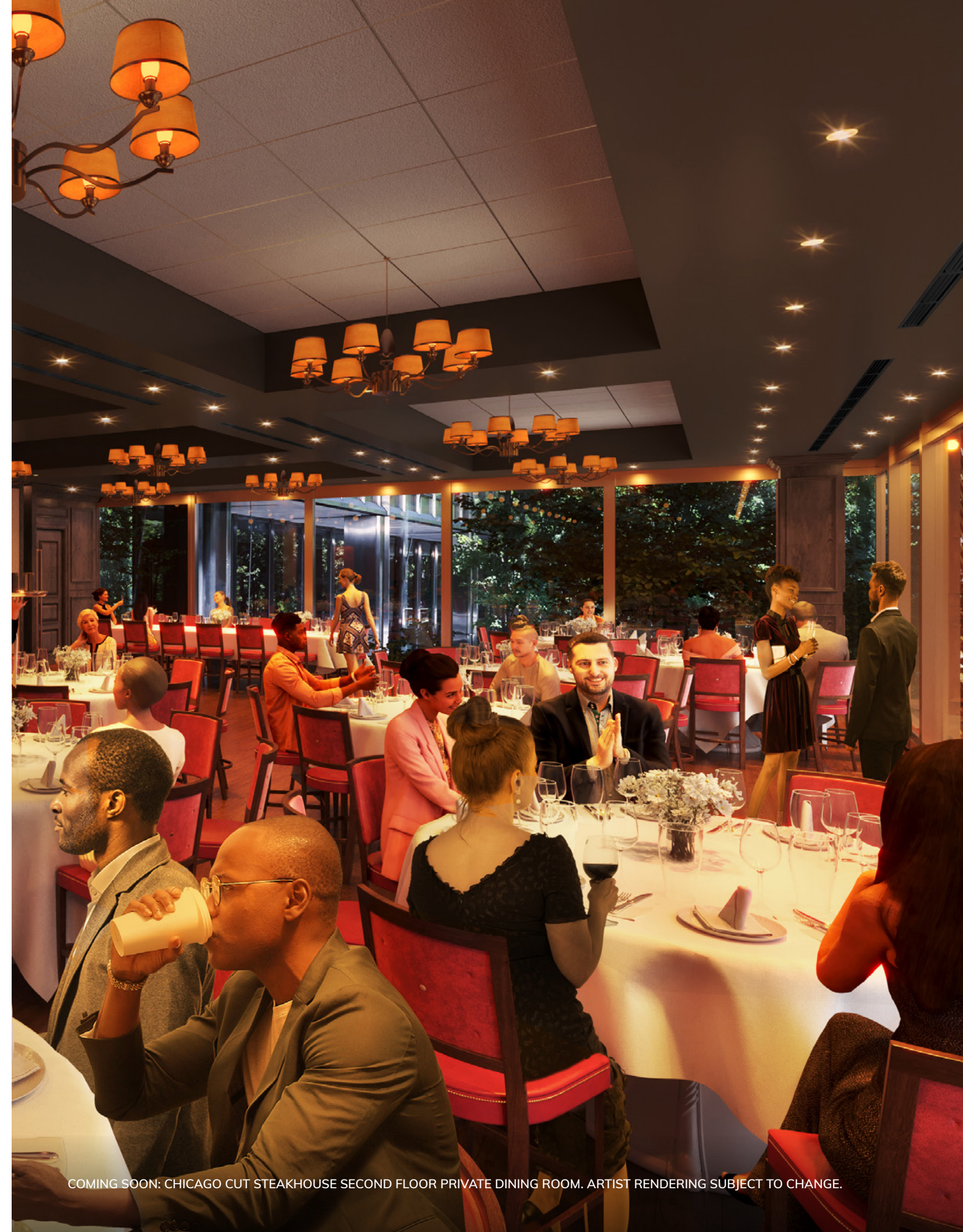
COMING SOON: CHICAGO CUT STEAKHOUSE SECOND FLOOR PRIVATE DINING ROOM. ARTIST RENDERING SUBJECT TO CHANGE.